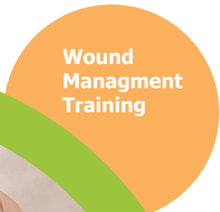
Wound Management Training