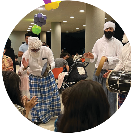
Girgaan Celebration - April