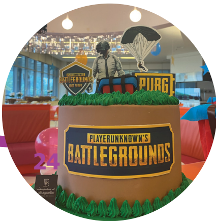
Patients' Special Celebrations