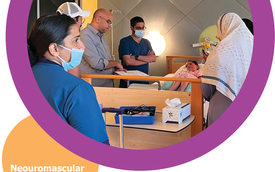
Neuromuscular MDT Days