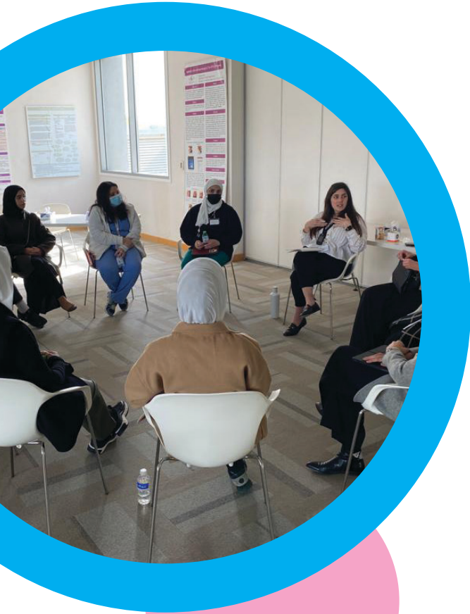
Annual Medical Students Days