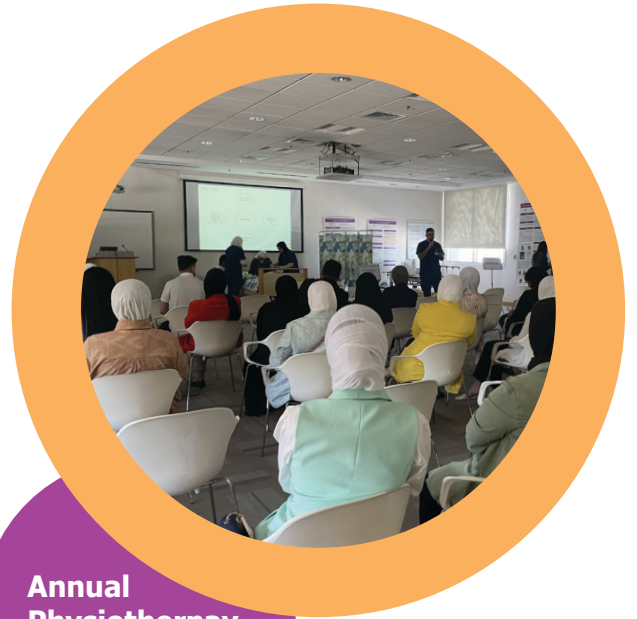
Annual Physiotherapy Teaching Day May 2023