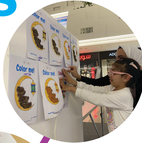
The Avenues Awareness Campaign - April