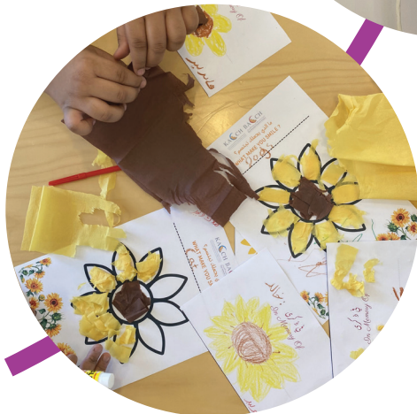
Annual Remembrance Ceremony - May