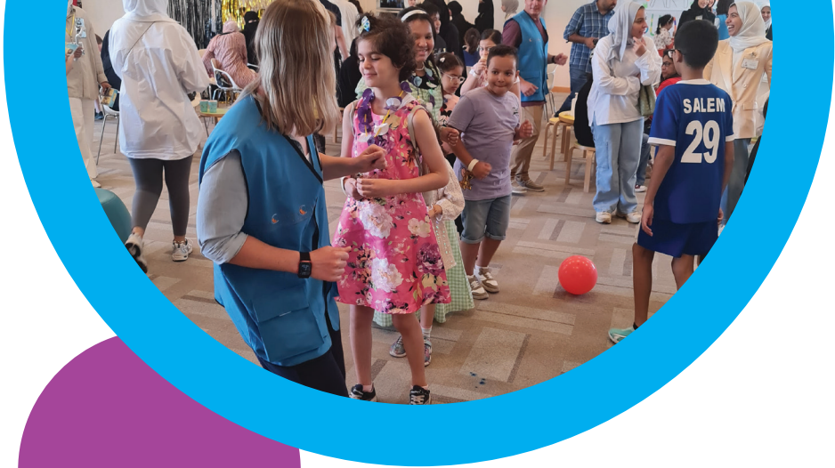
Saturday Sunshine August