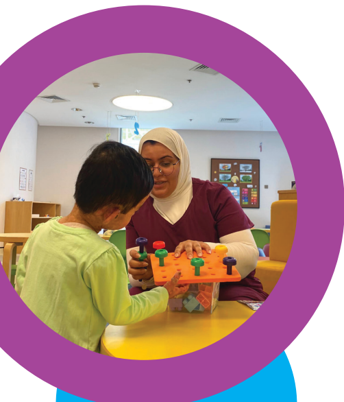
Occupational Therapy Sessions