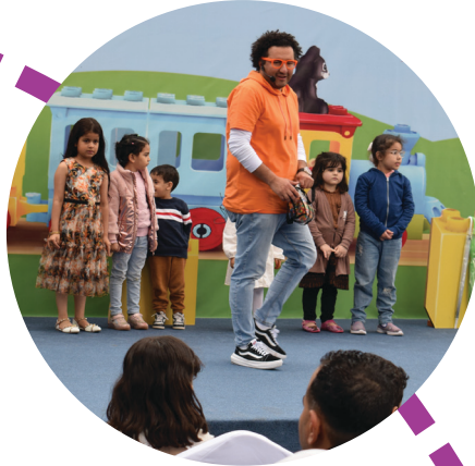
Bayt Abdullah's 10th Anniversary Celebration - March